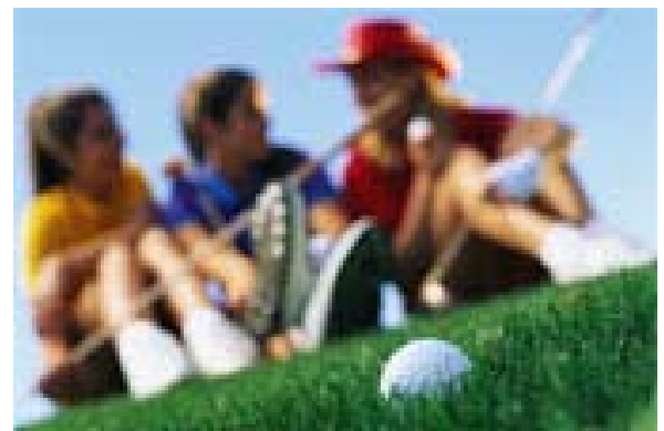
Juniors of all ages will enjoy learning the game while sharing the experience with their friends & family.

Www.boulderpointe.net One Champions Circle Oxford, Michigan 48371