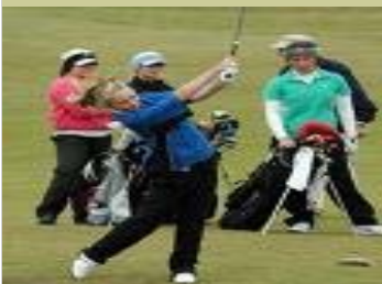
Juniors will compete in a team format in weekly matches.