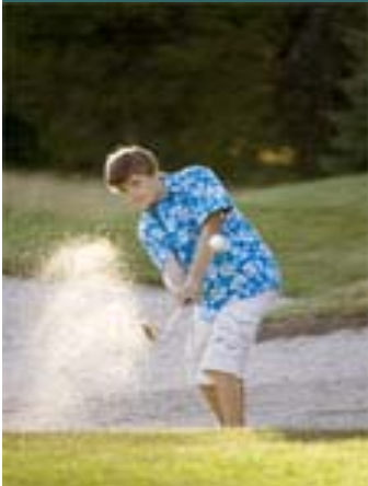
The junior instructional program will cover all areas of the game.

The Boulder Pointe Junior Instructional Program is designed for the intermediate junior golfer. The week long program involves 2 hours of instruction, focusing on one area of the golf swing each afternoon. Instruction is followed by golf on one of Boulder Pointe's three nine hole courses, the Bluffs, Peaks and Dunes. The